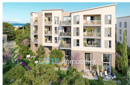
Programme neuf - Convention milancip - MLS Côte d'Azur