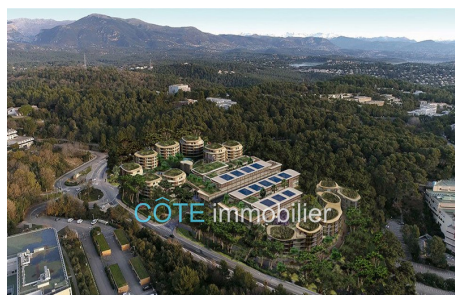
Programme neuf - Convention milancip - MLS Côte d'Azur