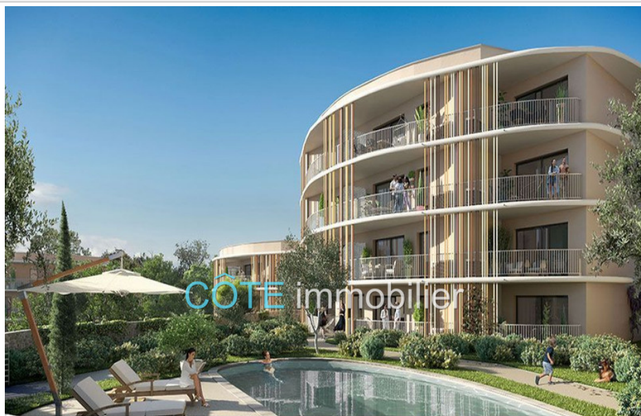
Programme neuf - Convention milancip - MLS Côte d'Azur