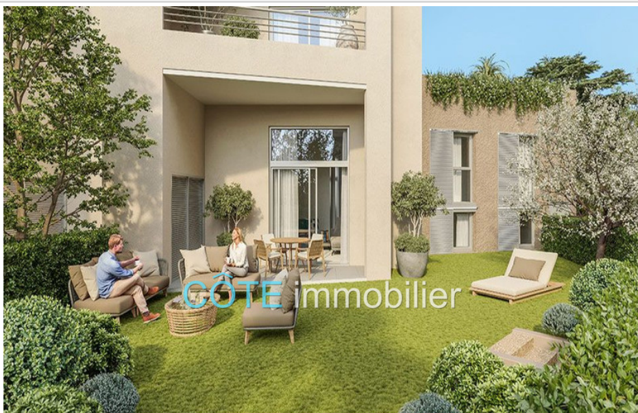
Programme neuf - Convention milancip - MLS Côte d'Azur