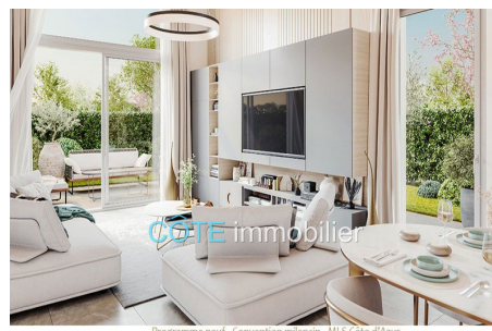
Programme neuf - Convention milancip - MLS Côte d'Azur